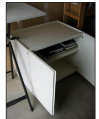
Storage cabinet 31.5" width, 22.5" depth, 28" height