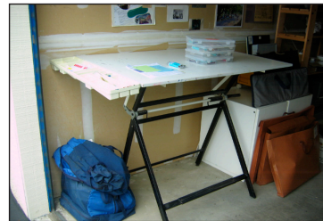
Drawing table - adjustable tilt and height 47" width, 31.5" depth, 44" height (plus or minus)

art equipment "free for the taking" by any Allied Arts member or artist friend . . .