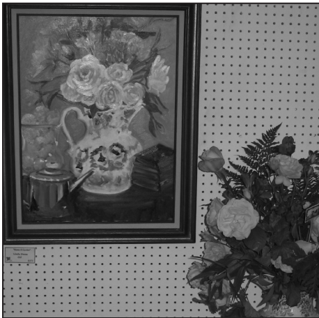
2009 Teapots, Petals & Palettes

The second annual Youth Art Show will open with a free reception on Friday, March 18th, and will run through April 3rd. We are looking forward to the colorful works of Cambria's students - from K through 12th grade, which will enliven the whole Gallery. Volunteer docents will be needed to cover the three weekends that the show will be open.