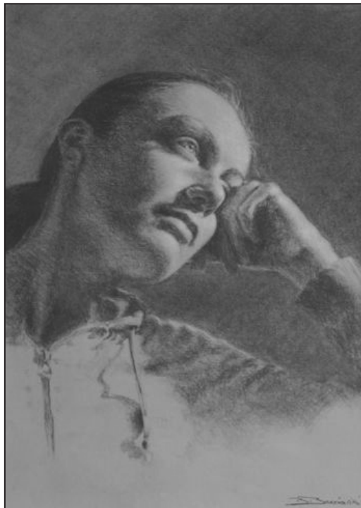
"Contemplation" by Bodil Bacciarini

See more of Bodil's work at: www.bodilfineart.com .