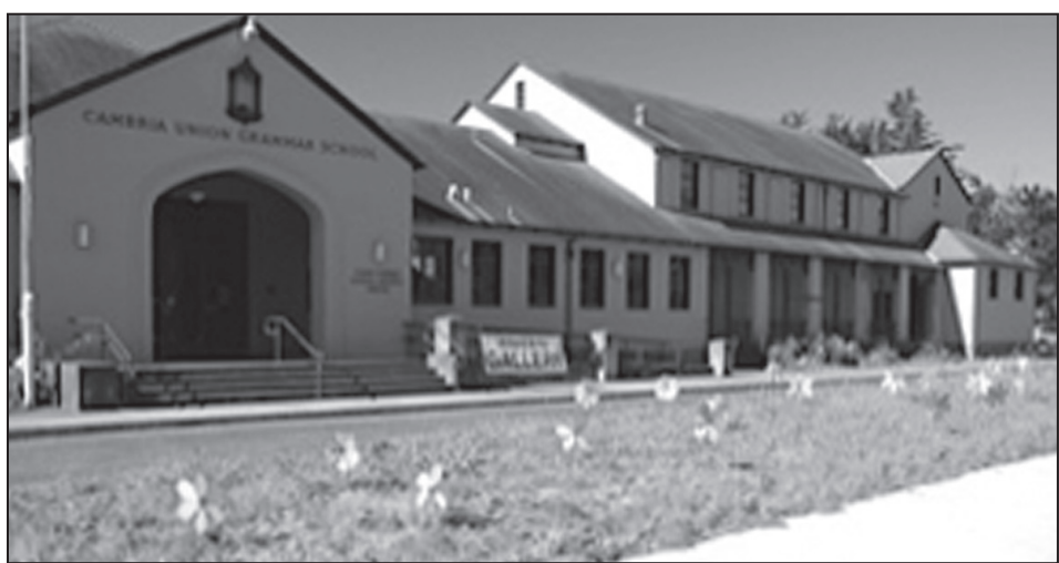
A bunch of spring flowers popped up, overnight, in anticipation of Teapots, Petals & Palettes. Take a walk or drive on Main Street and check them out. The pinwheel "flowers" are so much prettier in motion AND in color!

There is a new and different venue for Teapots, Petals and Palettes this year. The popular show last took place in 2009 at the Veterans Hall. You won't have trouble locating the show, just look for the field of flowers out in front of the Cambria Center for the Arts. Inside, you will be treated to wonderful juried art plus floral displays and refreshments May 7th and 8th. The show will continue until June 5th.